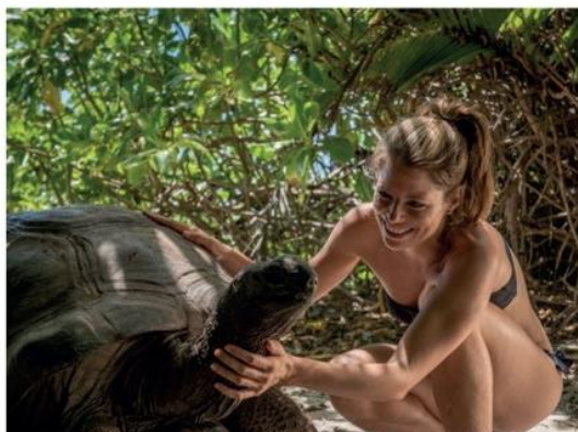
SEYCHELLES: Dream Islands in the Indian Ocean (May 2026 – October 2026)